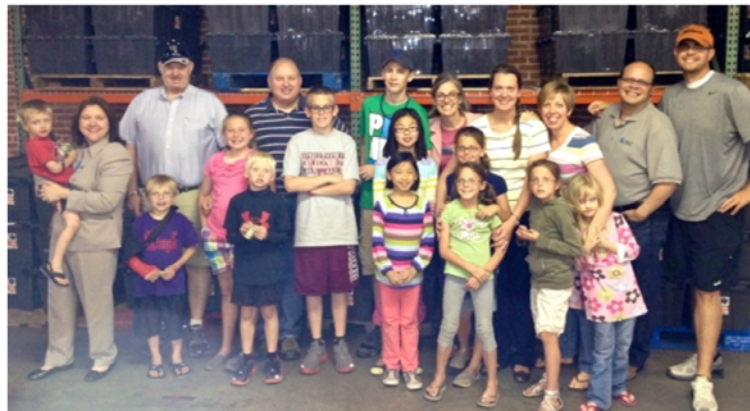
Another R.U.N. event in which members got together to prepare Snack Paks 4 Kids to be given to children in various areas of the city who may not have enough to eat on weekends when their schools are not open to feed them.